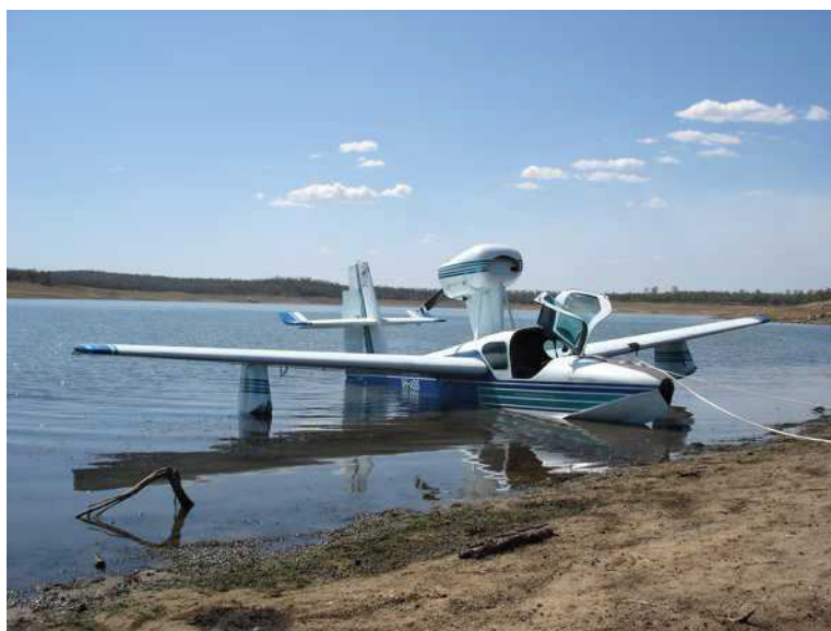
VH-ASS at Lake Boondambah.

Joining the Seaplane Pilots Association is easy just head to our website, and on any page click the Join Here button, payment is via all the normal methods including PayPal.