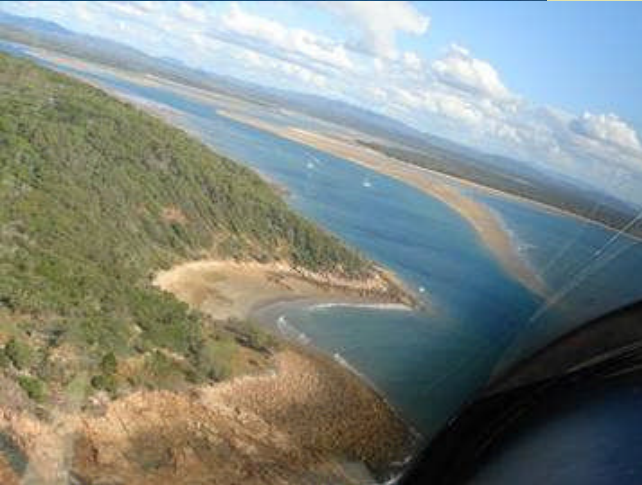
Pancake creek looking SW towards Turkey, from over Clews pt.

Next is Jenny Lynd creek foto is spring low tide, great exploring here but suited to Mermaid or Searey. Beach at rite of foto is Aeroplane Beach, which faces north. Lady Musgrave island is only 40nm due east and Gladstone 25nm NW from here.