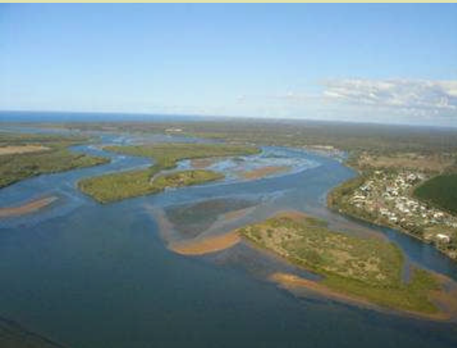
Port O Baffle Creek looking east, 40nm N Bundy....