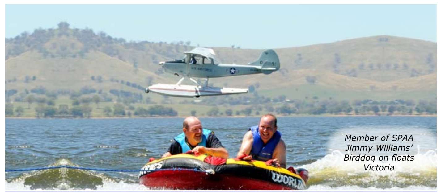
On The Step - Newsletter of the Seaplane Pilots Association of Australia - Issue 26 - May 2011 - Page 6